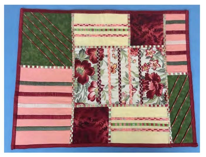
Link to We All Sew Blog: https://weallsew.com/fabulous-flatlock-and-pintuck-placemat/ Link to YouTube Sew Along: https://youtu.be/wu123iPVFsE

Each block cutting dimension is larger than its finished size. Flatlock, reverse flatlock and pintuck stitching all "eat up" fabric length and/or width. After stitching is complete, you'll trim each block to the designated dimensions. The larger dimension allows you to center your stitching.